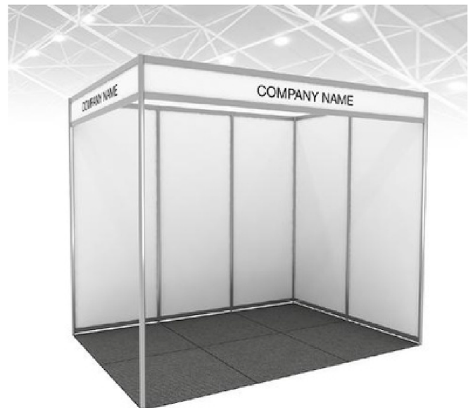
3x2 Corner Booth White Panels