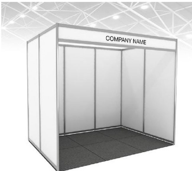
3x2 Inline Booth White Panels

Booths are allocated on a first come, first serve basis, after major partners have selected positions. Booth preferences are to be noted on the booking form.