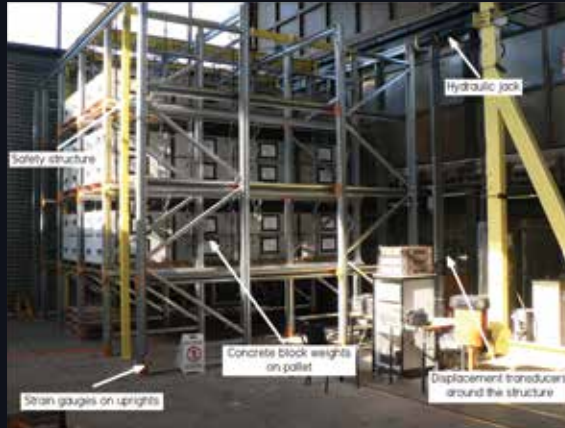
Test frame in Structures Laboratory at The University of Sydney; steel frames in Brisbane (left) and Melbourne (right), Australia.

factors of specific layouts, under scenarios of varying load combinations and maximum acceptable probabilities of failure: the frames were designed to fail in many different ways, such as through beam or column yielding, column buckling and elastic sway buckling. From this work the team expected that resistance factors would depend on the particular failure mode. While this is the case, they have found that such dependency is relatively minor. The resistance factors also do not appear to be sensitive to whether or not a frame system is braced or unbraced, regular or irregular; or to what kind of load combination it is subjected. As a result, the set of resistance factors that Rasmussen and his team have gathered from a wide range of 2D structural frame types is remarkably consistent. From a structural design engineer's viewpoint, this as a positive result, minimising the number of resistance factors that will need to be incorporated. It is hoped that the same will apply once further analysis of 3D frames, space frames for roofs and frames with slender cross-sections have been completed.