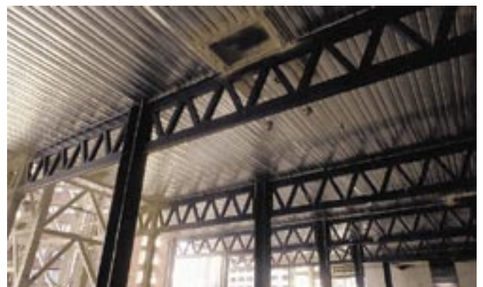
Fabricated trusses 100mm wide framed into the party walls.