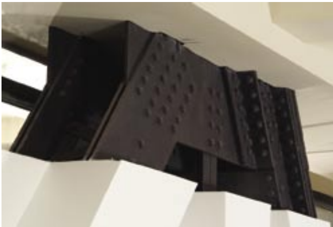
In some of the lower units the upper section of the original 75 years old riveted steel framing has been left exposed.

"The feasibility study for this design was carried out in 1999 and Stramit was very helpful with technical support and assistance," he said.