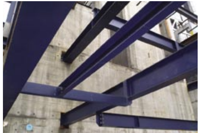
OneSteel 300PLUS® UB and UC framing reinforces the concrete core.