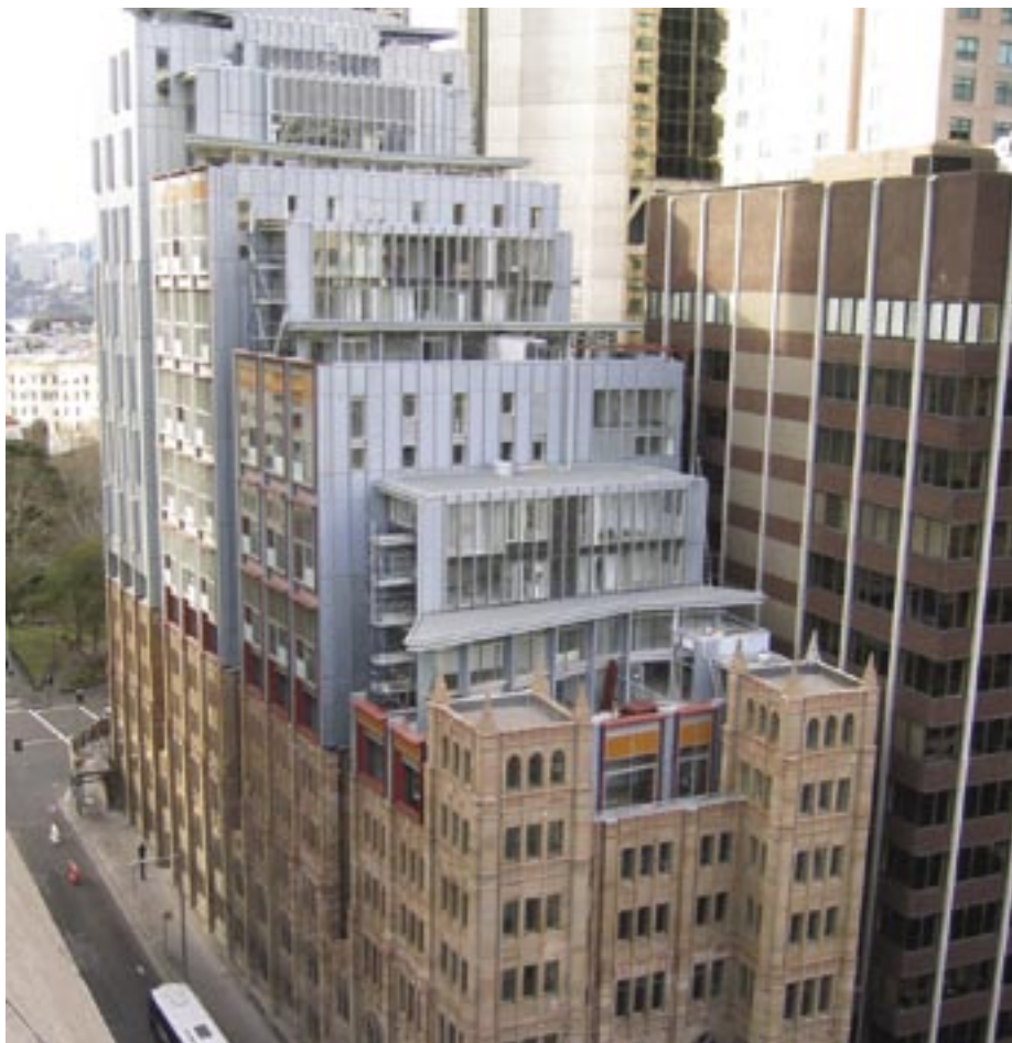
Above: The 'whale-tail' shaped roofs step up the building to reveal views to the south over Wynard Park. Top Left: From York Street the steel framed apartments above the Neo-Gothic heritage building take shape.

The underground Car Stacker extends 23 metres down below natural ground level, and the side of the shaft passes within 3 metres of the tunnels.